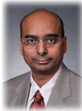
Dr. Suresh Alahari

The data show for the first time that these two microRNAs are highly expressed in breast cancer patients. The researchers were able to suppress the expression of microRNAs using a novel antisense compound that led to inhibition of breast tumor growth. This study will be helpful in developing novel breast cancer therapeutic drugs that target microRNAs in breast cancer patients. ■