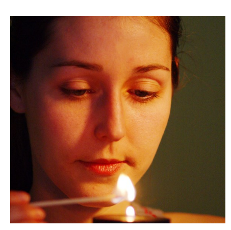
Remember to take time to relax to balance out stress.

breathing, relaxation techniques or exercise. If you are experiencing many of these symptoms, consider asking a professional counselor to assist you in identifying and dealing with stressors in your life. The Campus Assistance Program is available to faculty, employees, residents, students and immediate family members for assistance or guidance.