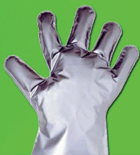
LAMINATE (Silver Shield®)