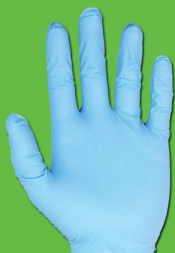
LATEX (Natural Rubber)